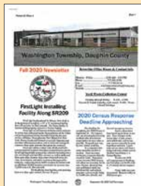
Population 2,001 to 5,000 Newsletters: Washington Township, Dauphin County