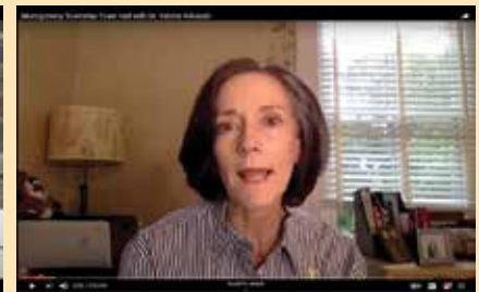
Audiovisual Communications (2-way tie): Montgomery Township, Montgomery County (virtual town halls, top left and right) and Horsham Township, Montgomery County (Horsham Township Library Grab-n-Go, left).