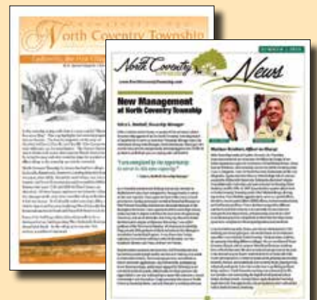
Most Improved Newsletter: North Coventry Township, Chester County