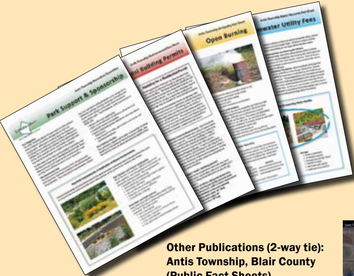
Other Publications (2-way tie): Antis Township, Blair County (Public Fact Sheets)