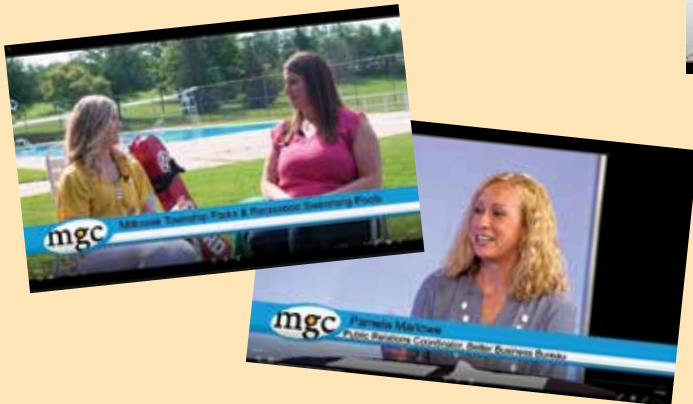
Cable TV Programs (2-way tie): Millcreek Township, Erie County (Better Business Bureau: Scams) and same township (Parks and Recreation Pools 2020 Program)