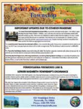
Population 5,001 to 10,000 Newsletters: Lower Nazareth Township, Northampton County