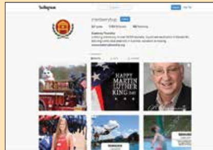
Social Media: Cranberry Township, Butler County (Facebook, Twitter, Instagram, YouTube, and Manager's Blog)

Watch for details on the 2021 contest coming in late summer and fall!