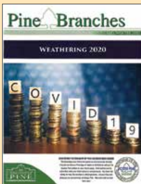
Population 10,001 and Over Newsletters: Pine Township, Allegheny County