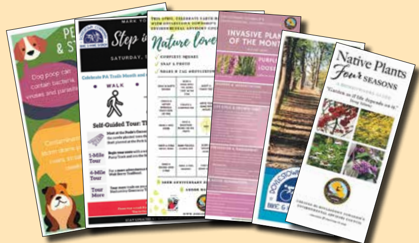
Other Publications (2-way tie): Doylestown Township, Bucks County (Brochures and flyers)