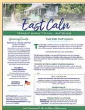
Population 2,001 to 5,000 Newsletters: East Caln Twp., Chester Co.