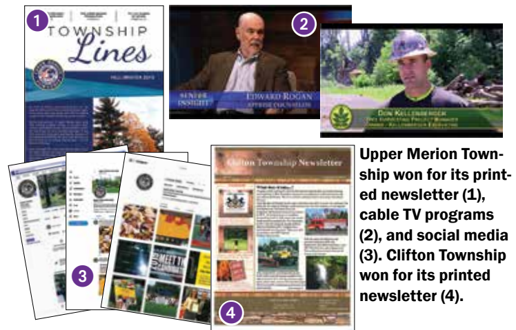
Upper Merion Township won for its printed newsletter (1), cable TV programs (2), and social media (3). Clifton Township won for its printed newsletter (4).

This annual contest recognizes townships across the state for their achievements in communicating with their resi-