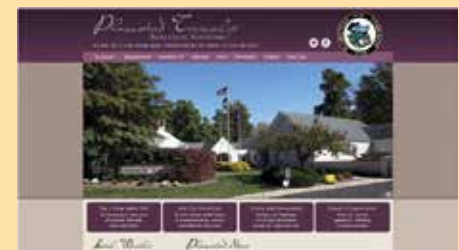
Websites: Plumstead Twp., Bucks Co.