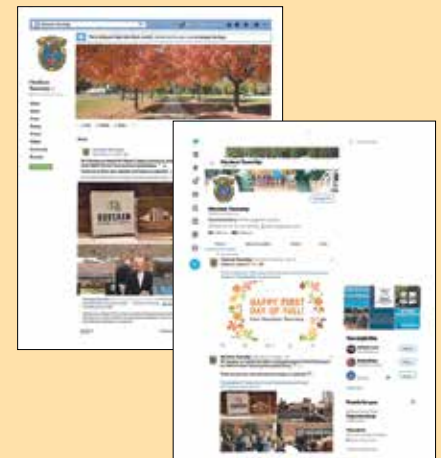
Social Media: Horsham Twp., Montgomery Co.