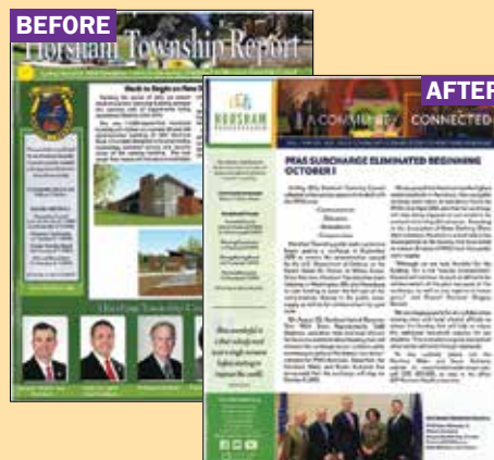
Most Improved Newsletter: Horsham Twp., Montgomery Co.