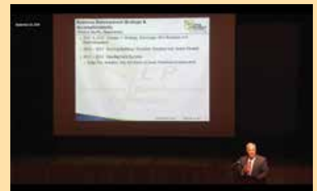
Audiovisual Communications: Lower Providence Twp., Montgomery Co. (Board of Supervisors Open House)