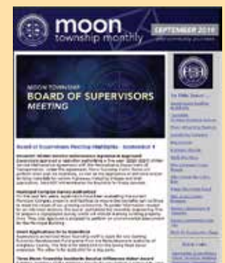
Electronic Newsletters: Moon Twp., Allegheny Co.